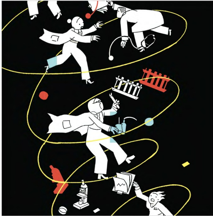
Many results that are rigorously proved and accepted start shrinking in later studies.